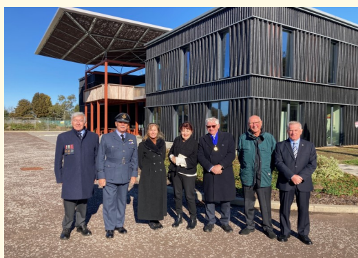
Members of 7 Squadron Association visiting the site of RAF Oakington in October 2023

In October, we were pleased to have the support of Homes England so that visiting members of 7 Squadron Association could visit the former RAF Oakington site. This opportunity was much appreciated by those of us who attended, and the visit helped to strengthen the ties between Northstowe, the Heritage Society and 7 Squadron Association. Discussions took place regarding whether Northstowe library could provide the display and storage of the LDHS Archives which the members of LDHS and the former veterans have worked so long for.