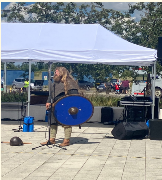
Hereward the Wake in full, dramatic flow.

Hereward the Wake gave a dramatic account of his life as an 11 th century nobleman's son before leading the local guerrilla resistance against the occupying forces of William the Conqueror. Later in the afternoon he delivered demonstrations of Anglo-Saxon armoury and of beer making to the attentive crowds.