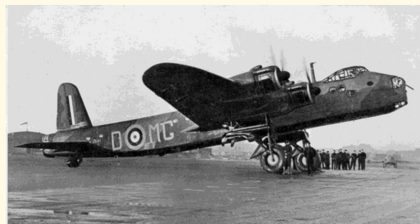
Stirling Bomber at RAF Oakington

More information on ARG can be found on their website: www.airfieldresearchgroup.org.uk