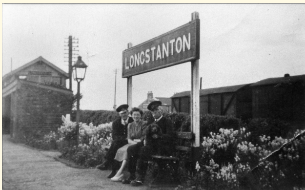
Staff at Longstanton Station

Since archiving started in 2005, the Heritage Society, and those who founded it, always realised that the history of our communities is not just what happened in the past but is also what happens today. LDHS endeavours to remember this in everything we do and we are delighted that Northstowe News donates copies of their magazine to the Society for safe-keeping within the LDHS Archives.