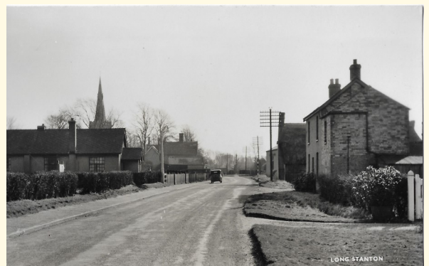
Postcard image of Longstanton High Street c 1930's

Despite the pandemic the archives have continued to grow. It is now over 15 years since archiving of our shared history began and the collection we have put together is of historic importance. We hope with our immanent move to the Heritage Annex building, the LDHS Archives will be safeguarded in perpetuity and can be appreciated by members of our communities and visitors, for generations to come.