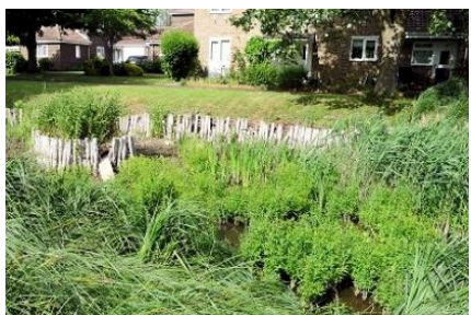
Ladywalk pond in Oct 2019 - water all but gone, choked by sedge and rushes

LDHS comment: Landscape features are part of the heritage that LDHS is obliged to try to protect. As in previous years, we will continue to highlight concerns in the hope that action will be taken to rectify this environmental crisis.