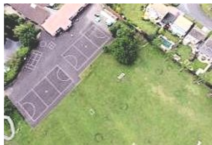
Aerial view of the Hatton Park School playing field, 2019

Organised by LDHS, in association with the Fen Edge Archaeology Group (FEAG), Longstanton and Northstowe residents have been invited to participate in an archaeological test pitting event over the weekend of 28 th /29 th September on the playing field at Hatton Park School, Longstanton. The school is on the site of the Mansion House of the Hatton family which replaced an earlier