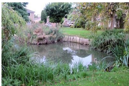
Ladywalk pond in Oct 2013 - water level good, it's been home for ducks for years

In June, our Secretary was contacted by a village resident expressing concern for the historic pond that lies within Ladywalk. In view of our previous work we have pressed the Parish Council to investigate what can be done in this case.