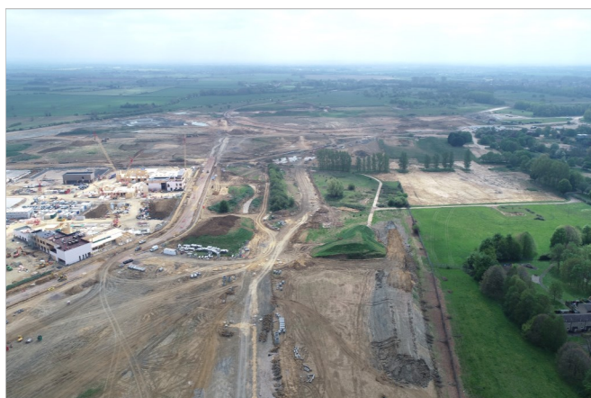
Construction of the Secondary College and SEN School on Phase 2.

September 2019, will see the first intake of pupils into the new Northstowe Secondary College which has been built on the former site of RAF Oakington (Phase 2). Approximately half of this single year intake will come from the Longstanton school whilst the remainder will come from the wider area. In total it is estimated that 70 pupils will be starting school at the secondary college this Autumn, representing another historic milestone in the birth of this new town. LDHS has welcomed the communications we have already had with the Head of School and look forward to supporting the school in its development of local history provision so the pupils can understand the history of the school site and the origins of the new town.