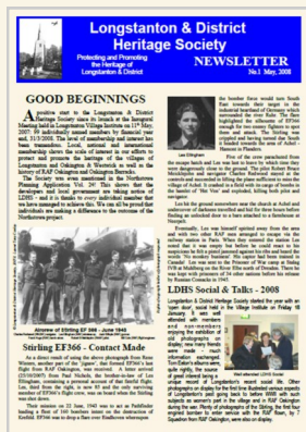
Our very first Newsletter, May 2008, marking the year 2007/8

Over the years we have published openly the aims of our organisation and its successes. We have invited input from both members and non-members. A LDHS website was created and more recently this has been followed by a 'Facebook' page. During the last 10 years over 50 public talks have been held on varied subjects relating to local history. Regular updates in the Longstanton Life have allowed members and non-members within the community to follow our work. Historical snippets and the publication of internet links, heritage posters etc, ensure our work is providing a high quality educational resource.