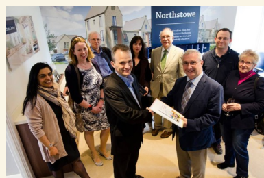
Members of the Northstowe Community Working Group at the official launch of Northstowe held on 11 May 2017 on the Bloor Homes site

2017 marks a watershed moment for Longstanton and Northstowe. Out of the soil and fields of Longstanton's parish lands is rising the first new town built in England since Milton Keynes. Although construction of the new town started a while ago, after years in the planning, this Spring saw the first residents move into the new homes built by Bloor Homes just opposite what was Crabtree Corner on the B1050. The occasion was marked by an official launch event on the Bloor Homes site.